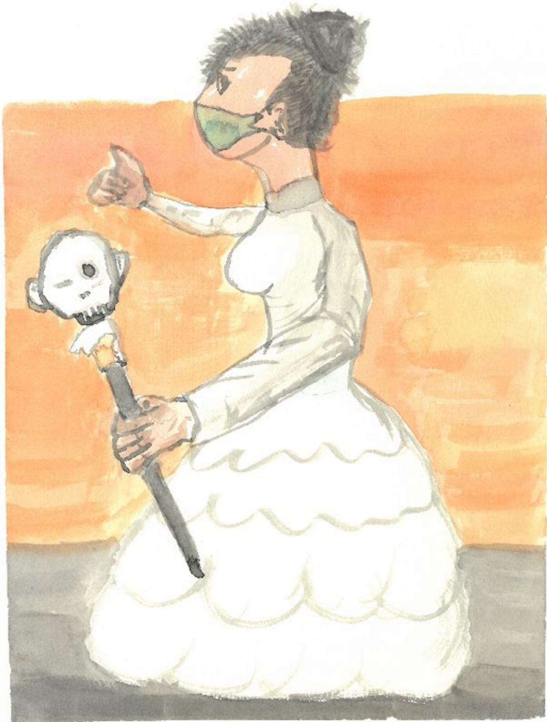
Illustration ©Ski, 2020