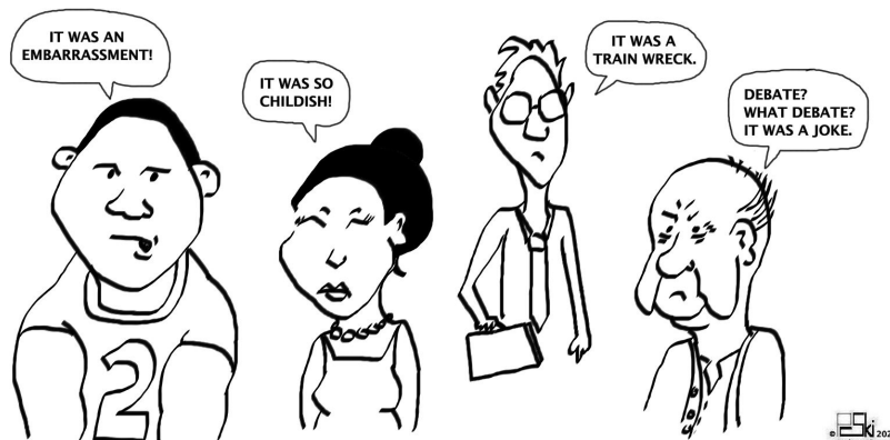
UNITED IN THEIR DISGUST FROM THE FIRST DEBATE

If people were worried about socialism, 2020 was the year of the Banana Republic.